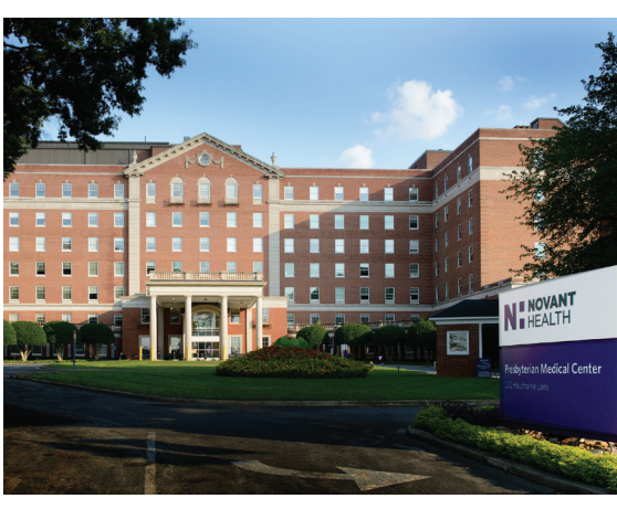
The Presbyterian Medical Center, part of Novant Health

Hale says, "Access to Novant Health's centralized EMR system can't go down, and it can't slow down. Uploading a huge MRI or CT scan file at an imaging facility can't impact the ability of a health clinic to quickly access a patient's chart."